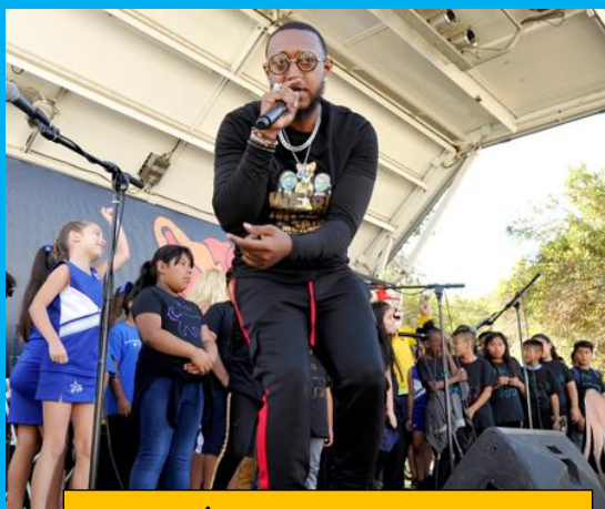
3 rd Rock Hip Hop Performances at NOON & 2:00 PM PST