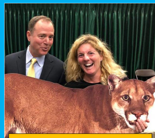
Congressman Adam Schiff 12:30 PM & 2:30 PM PST

BE SURE TO CHECK THE WALKS & TALKS ZONE AT THE FESTIVAL FOR A SCHEDULE OF AMAZING PRESENTATIONS FROM WILDLIFE LEADERS!