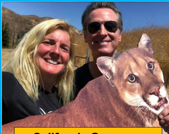
California Governor Gavin Newsom 11:30 AM PST

Featuring special guest appearances, cool wildlife videos, musical performances and more! Highlights of the stage program below.