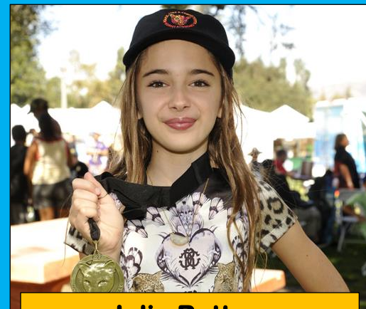
Julia Butters Actress 1:30 PM & 3:30 PM PST