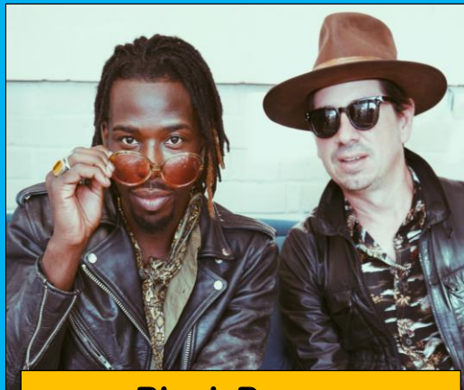
Black Pumas Performances at 1:00 PM & 3:00 PM PST